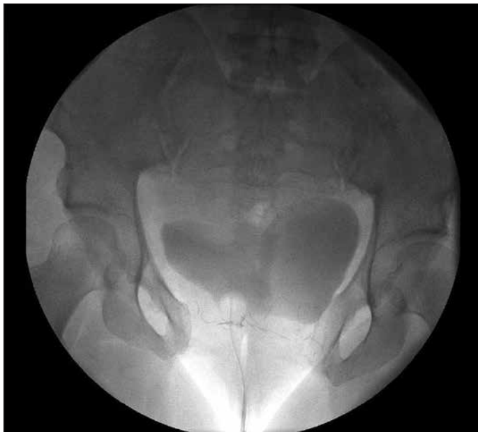
Figure 1. Voiding cysto-urethrography showing incomplete bladder duplication