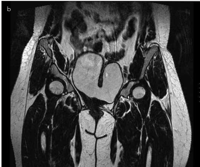
Figure 2. a, b. MRI appearance of incomplete sagittal bladder duplication on a transverse plane (a), MRI appearance of incomplete sagittal bladder duplication on a coronal plane (b)

Lower urinary system abnormalities are usually diagnosed either at birth or during childhood when US examination, for any reason, is performed into the urologically asymptomatic patient or when causes of urinary tract infections are evaluated. However, there are two cases with BD that remained asymptomatic for more than 5 decades in the English literature (5, 6). Our patient was relatively older at the time of diagnosis since she had no symptoms related to BD.