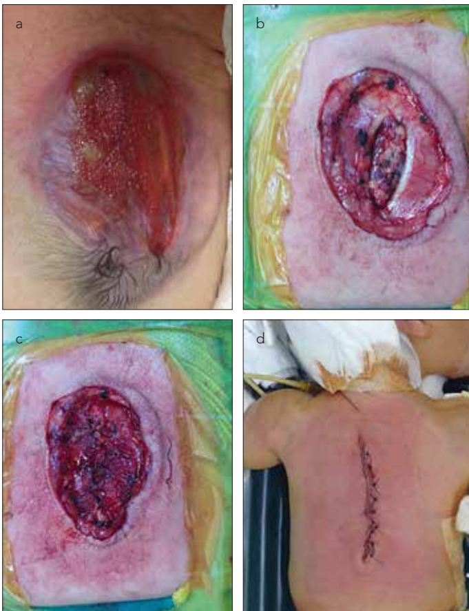
Figure 2. a-d. (a) Open myelomeningocele sac. (b) Closed dura, 5-0 suture material used. (c) Closed fascia on the dura, 4-0 absorbable material used. (d) Closed skin defect, 3-0 prolene suture used

placed in the prone position. The epithelial zone around the sac was incised through a full-thickness skin incision and was totally excised. Fascia and dura were seen. Following the circular exci-