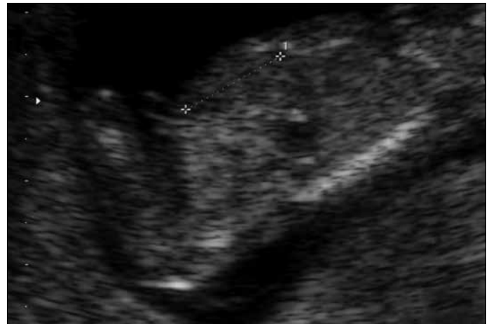
Figure 1. Measurement of Fetal liver length

trisomy 21, there is no correlation between liver enlargement and NT, tricuspid failure, and abnormal DV blood flow (6).