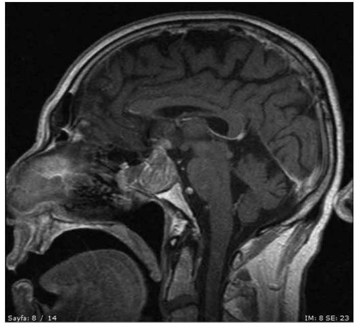
Figure 2. Mass lesion having sellar–suprasellar localization, generating pressure on the optic chiasm, a thickening infundibulum, and having extension into the sphenoid sinus in pituitary MR. MR: Magnetic resonance