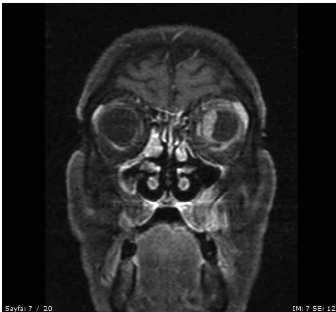
Figure 1. Mass lesion having contrast involvement not extending out of the globus in the medial and left globus in orbital MR. MR: Magnetic resonance

insipidus or oculomotor nerve palsies can be seen (4). In our case, a 69-year-old male patient presented with intermittent gross hematuria and irritative micturation. There was no medical feature in his medical history. Urothelial carcinoma was detected in the bladder. Mass lesion was observed in the right lung in chest radiography. Orbital magnetic resonance (MR) imaging was performed because of redness in the left eye in fundus examination. In orbital MR, the mass lesion was observed to not extend out of the globus at the medial in the left globus, which had a hypointense feature in T2-weighted series and a mild hyperintense feature in T1-weighted series, with contrast involvement restricted in diffusion in diffusion-weighted examination and with a diameter of approximately 12×8×17 mm at its widest (Figure 1). Pituitary and brain MR were conducted on observing the mass in cella in the sections examined. In the pituitary MR, a mass lesion with an approximate diameter of 27×33 mm at its widest was observed, which had sellar–suprasellar localization, generated pressure on the optic chiasm, had thickened infundibulum, and had extension into the sphenoid sinus. The mass leaned to the cavernous portion of the bilateral internal carotid